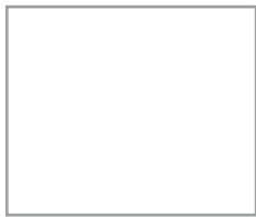
Pad Print - Front 100%